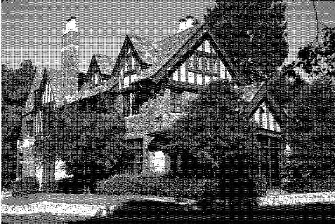
View of front ( http://www.ocgi.okstate.edu/shpo/shpopic.asp?id=76001577 , accessed May 7, 2009).